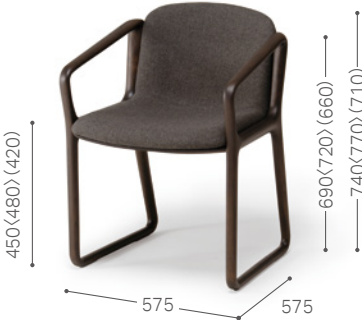
① Japanese Oak DGY Tonica DGY/F4 (Outside: BQ-BL/L3)