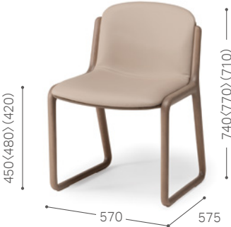
② Japanese Oak GY MG-LGY/L3 (Outside: MG-KGY/L3)